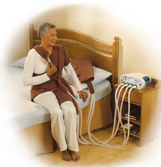
FIGURE 1: Example of IPC, Flexitouch® system.

Phase II requires choosing an appropriate compression garment depending on the affected body part. If an off-the-shelf garment does not fit, a customized garment can be ordered especially if the patient has an irregularly shaped limb. If lymphedema is severe, night compression garments, such as velcro closure or foam garments, might be necessary to keep edema under control. Garments should be washed daily for hygiene and replaced every four to six months to maintain compression strength. 13